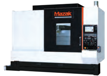
Table size 51" x 21" Primary and secondary processes include keyways, chamfers, tapped holes, profile milling, and other milling applications